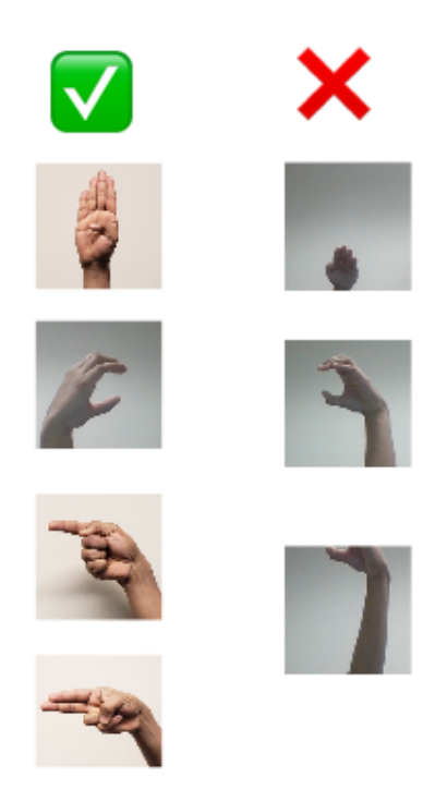
Figure 2: Acceptable Images (left) and Unacceptable Images (right)