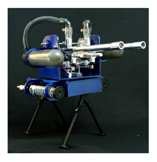
Figure 2 - An Example of a Full-scale Paintball Turret [3]

The prototype paintball turret successfully emulated the functionality of a full-scale version (see Figure 2), i.e. pan/tilt motion and shooting function.