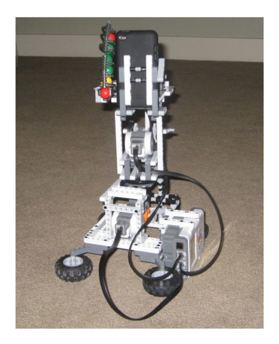
Figure 3 - Prototype Paintball Turret (Final Revision)