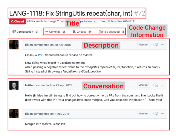
Fig. 1. An example of a pull request [Lang#72] on GitHub

<sup>†</sup> "SLOC" refers to the number of lines of Java code, calculated by cloc [7]. "#PR" refers to the number of reviewed pull requests.