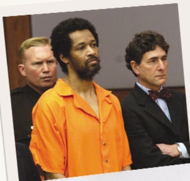
D.C. sniper John Allen Muhammad, 2002