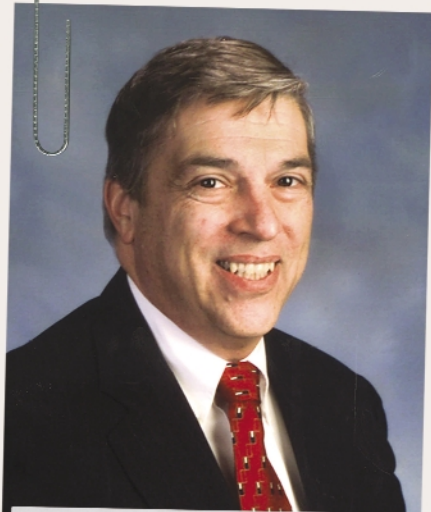
FBI traitor Robert Hanssen