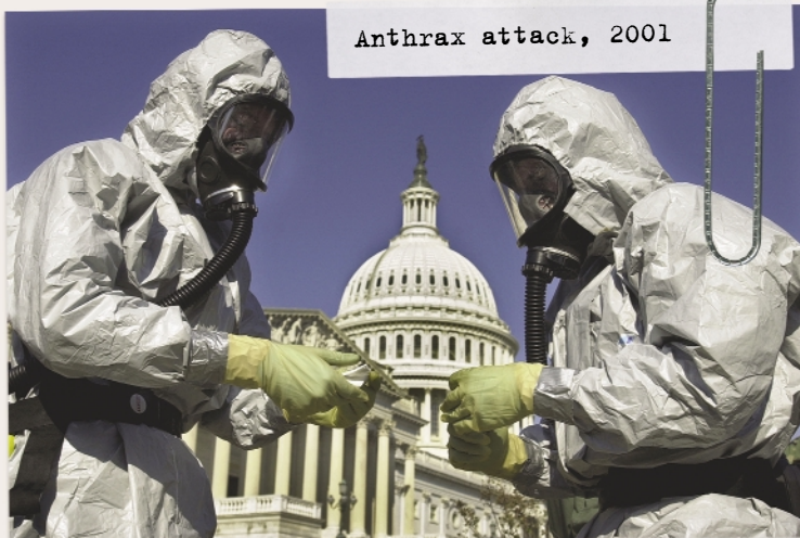
Anthrax attack, 2001