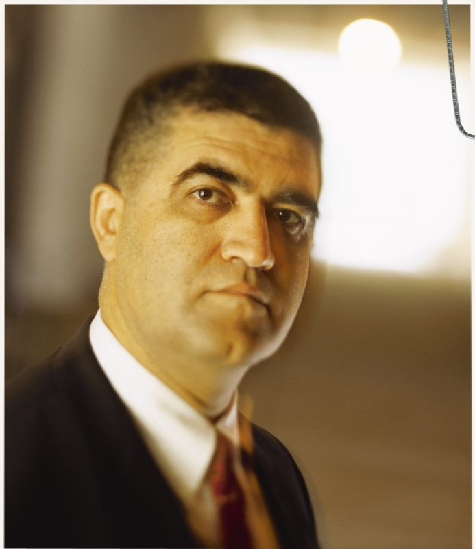
CIO ZALMAI AZMI instituted new IT management processes, but is the FBI ready for the next big software project?

Also in September, the U.S. General Accounting Office