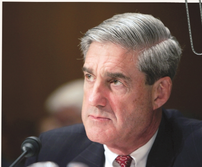
FBI DIRECTOR Robert S. Mueller III is grilled by lawmakers about the FBI's IT systems every time he goes to Capitol Hill.

FBI officials say they are taking what they learned from the VCF and charging ahead with new IT projects on two major fronts. Last September, the White House's Office of Management and Budget tapped the bureau to spearhead the development of a framework for a Federal Investigative Case Management System, an effort involving the National Institutes of Health and the departments of Justice and Homeland Security. The goal here is to provide a guide